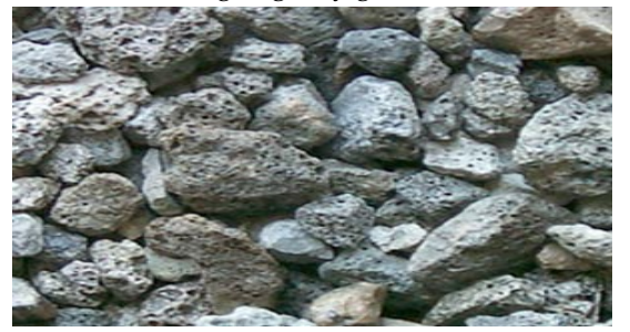
Fig No 1: Blast Furnance Slag